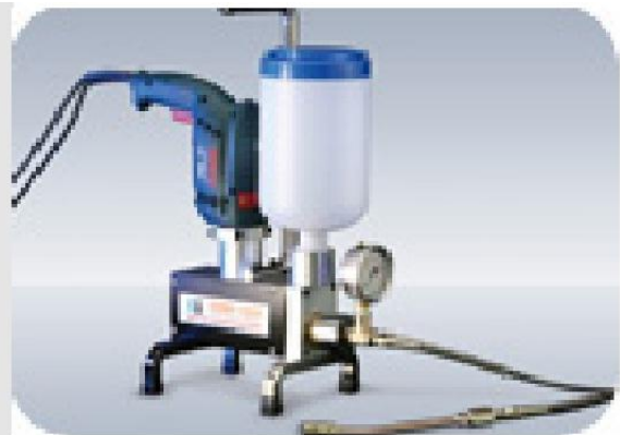
2) Injection equipment for PU Foams